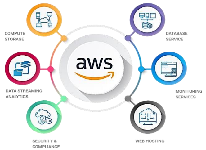
Fig. 3. AWS Services

In the central AWS logo is connected to six categories of cloud services: Compute Storage, Database Service, Monitoring Service, Web Hosting, Security & Compliance, and Cloud Streaming Analytics in the following Figure 3. Each category is represented with an icon and color, signifying its function. The design illustrates AWS's diverse offerings in cloud computing, data management, and security [16]. It highlights how AWS supports various IT and business needs through scalable and reliable cloud solutions.