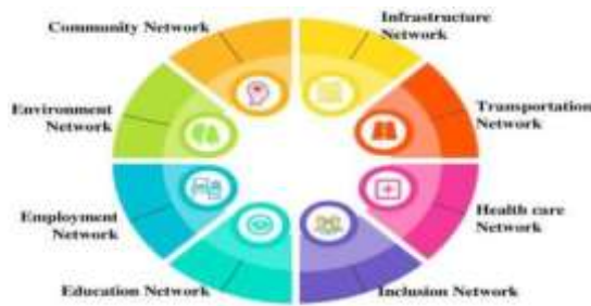
Fig. 2. Key Networks for Building a Disaster-Resilient Smart City [46].

The primary networks involved in creating a resilient smart city include.