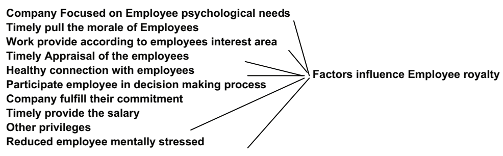
Figure 3: Factors influence Employee Royalty.

looking. Sometimes, that conduct could have been impeding to the organization and the representative's own inspiration. That can form into a propensity and become a major issue before long. Really devoted individuals will consistently go the additional mile since they as of now have that characteristic drive in them. They do not simply consider being as only a vocation to complete. They consider it to be an open door for progression. A steadfast worker will quite often have the characteristic inspiration to give a valiant effort and attempt to complete things as productively as could reasonably be expected. Employee loyalty not only useful for employees as well as for employees also. Below we discuss in Figure 2.